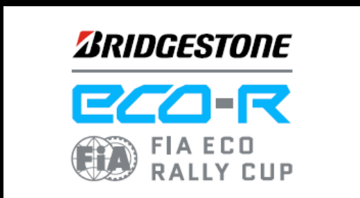
Bridgestone FIA ecoRally CUP

New activities in celebration of our 60 th Anniversary