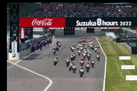
EWC/ Suzuka 8 Hours Endurance Race