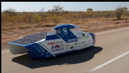
Bridgestone World Solar Challenge