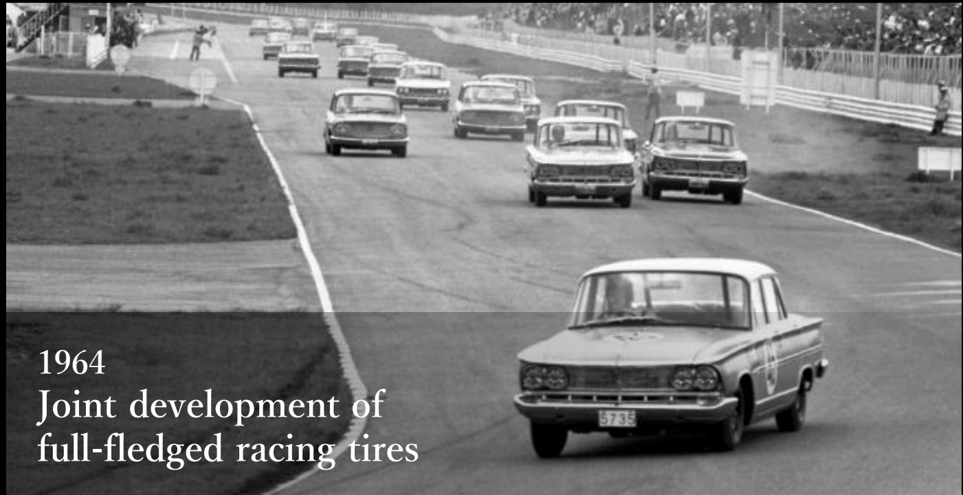
1964 Joint development of full-fledged racing tires