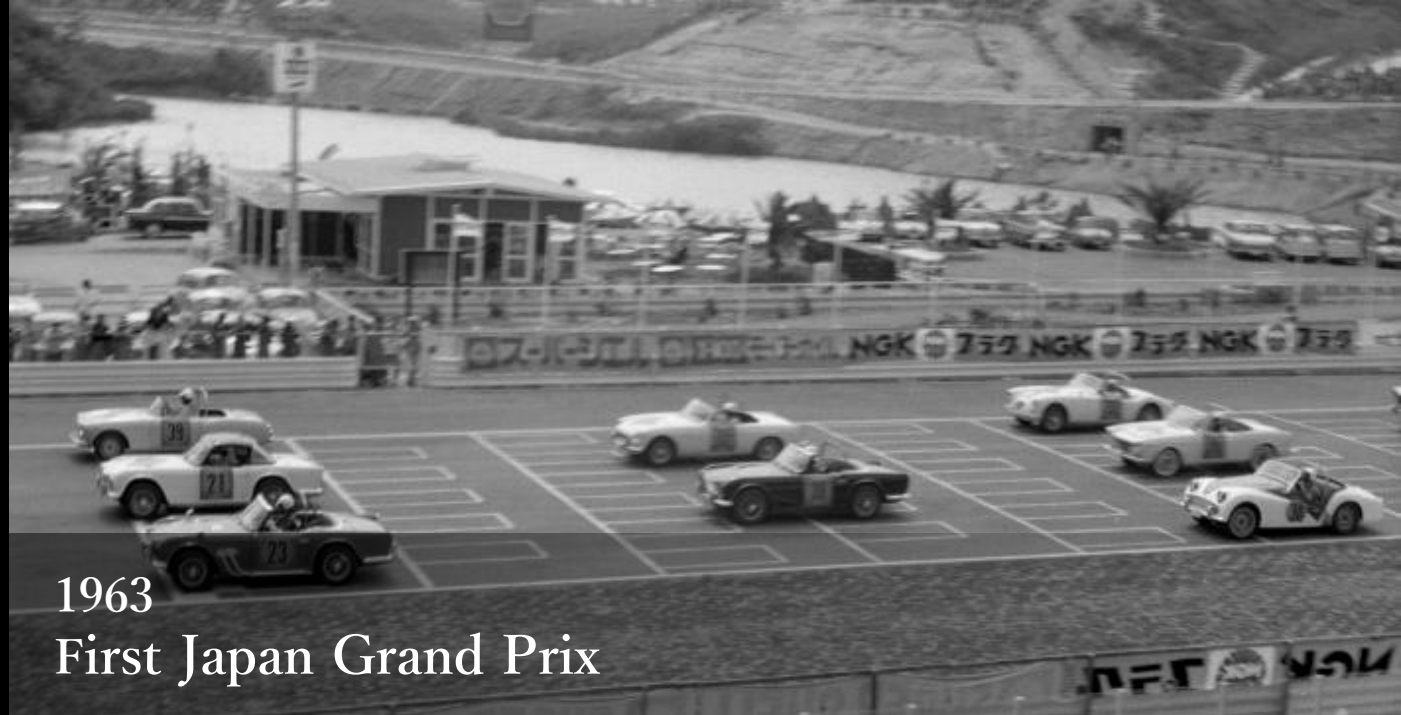
1963 First Japan Grand Prix