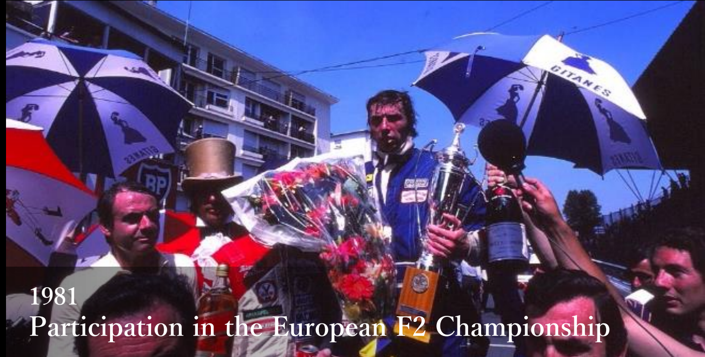
1981 Participation in the European F2 Championship

Building foundations to challenge the world's top races