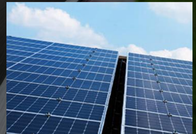
Green & Smart factory