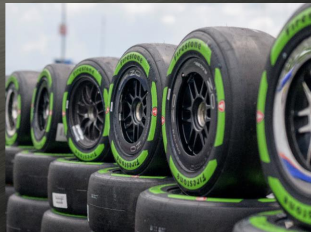
Guayule INDY tire