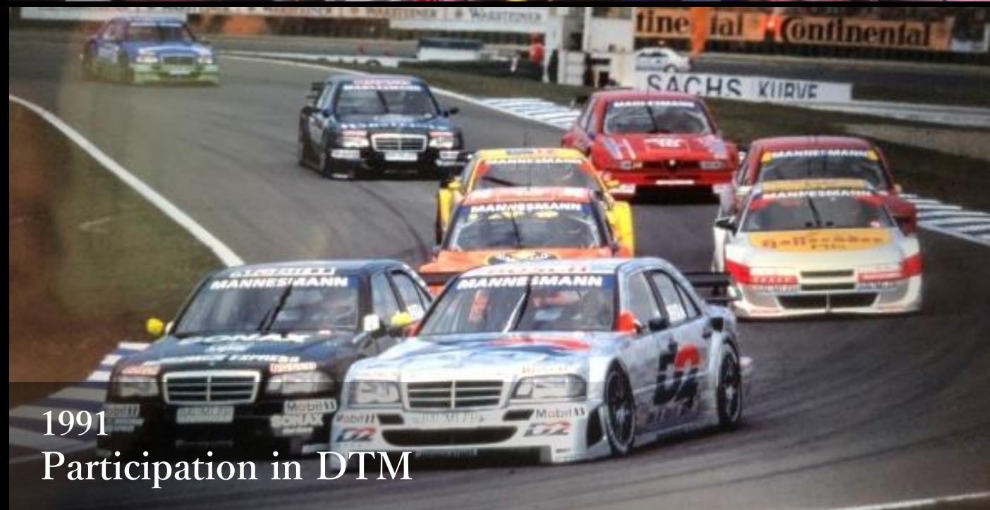
1991 Participation in DTM