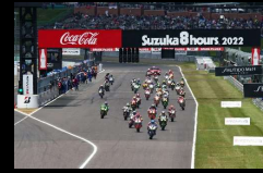
EWC/ Suzuka 8 Hours Endurance Race