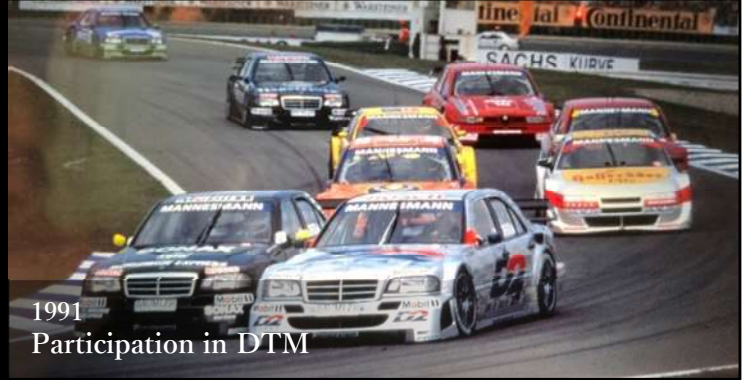
1991 Participation in DTM