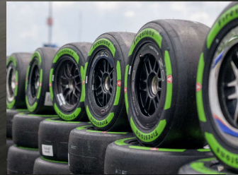
Guayule INDY tire