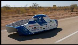
Bridgestone World Solar Challenge