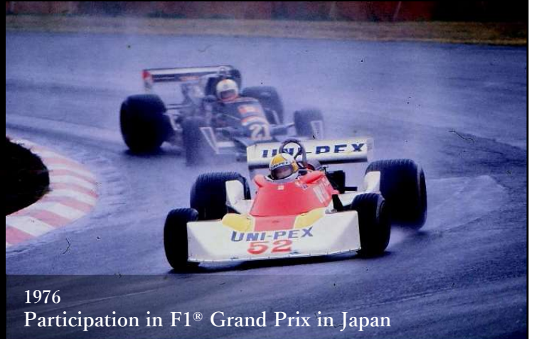
1976 Participation in F1® Grand Prix in Japan

Starting point toward global motorsports