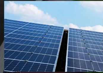
Green & Smart factory