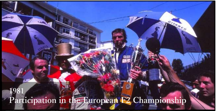
1981 Participation in the European F2 Championship

Building foundations to challenge the world's top races