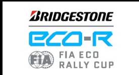
Bridgestone FIA ecoRally CUP